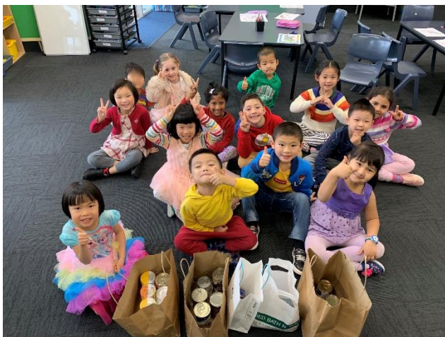
Room 10 with some of the cans and tins they donated for the Salvation Army